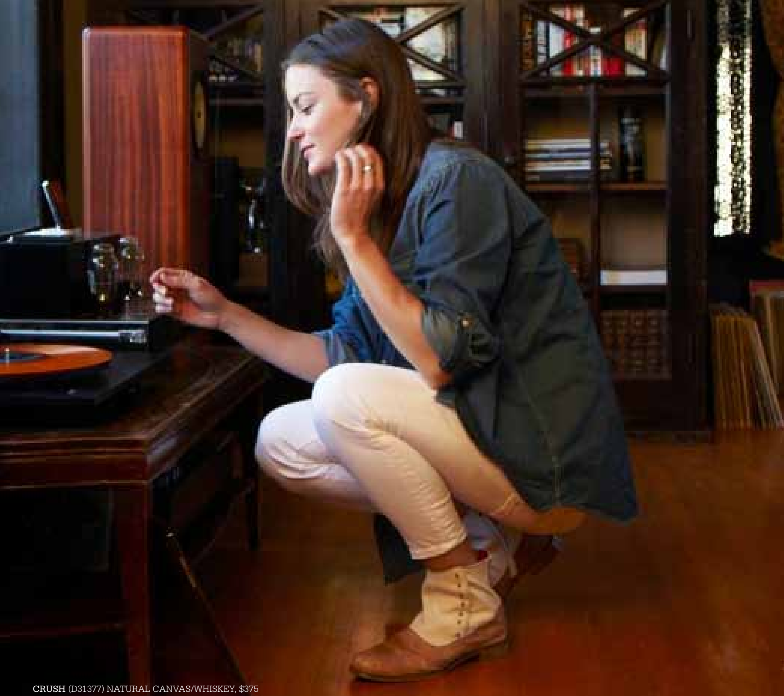
CRUSH (D31377) NATURAL CANVAS/WHISKEY, $375 Supple vegetable-tanned leather and pure cotton canvas, both crafted in Italy.