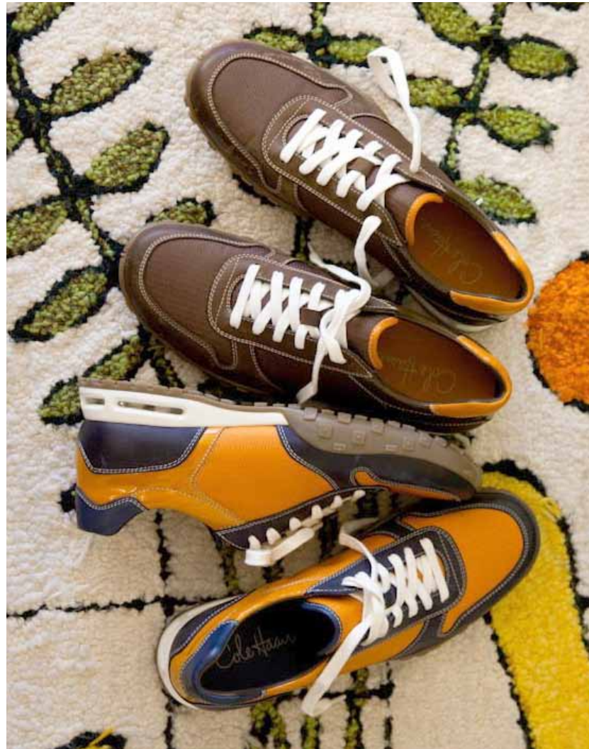
Opposite: AIR MARCUS SPORT OXFORD (C08147) CHESTNUT/RED, $158 A sporty, leather-lined oxford in supple leather and Nike Air.