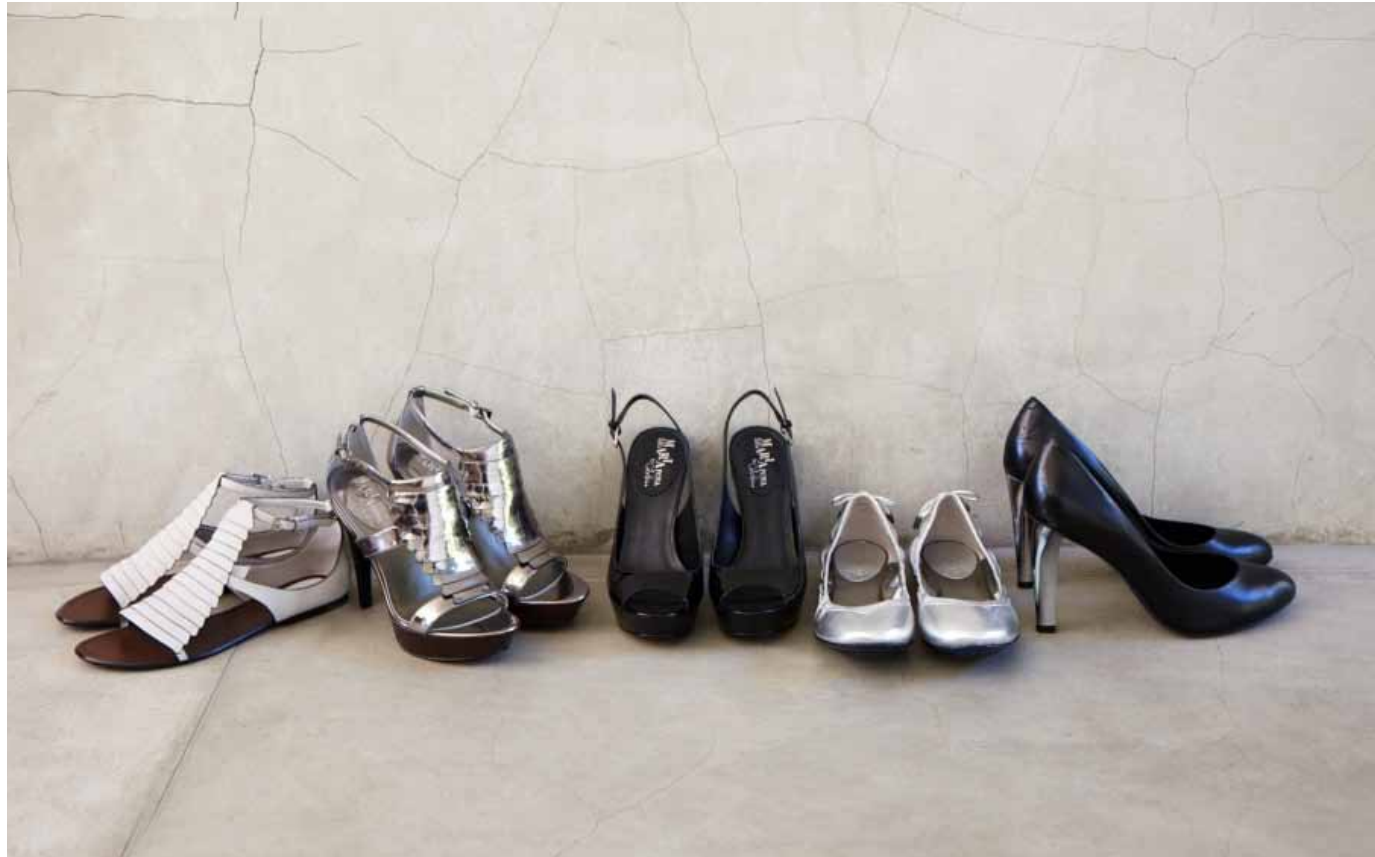
Above, from left to right: AIR GWALTNEY GLADIATOR (D30832) FEATHER NUBUCK, $148 AIR GWALTNEY OPEN-TOE PUMP (D30851) GUNMETAL, $198 AIR RENFROW OPEN-TOE SLINGBACK (D31501) BLACK PATENT, $178 AIR BACARA BALLET (D30768) SILVER METALLIC, $138 AIR RENFROW PUMP (D31554) BLACK/PEWTER, $198