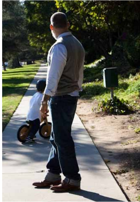
AIR COLTON WINGTIP OXFORD (C08435) BRITISH TAN CALF, $198 Hand-burnished calfskin lined with perforated leather, with Nike Air.