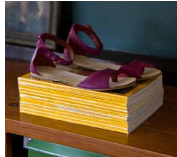
KISSER (D31389) FATIGUE, $150 Cuffed toe-ring sandal in supple, vegetable-tanned Italian leather with buffed footbed.