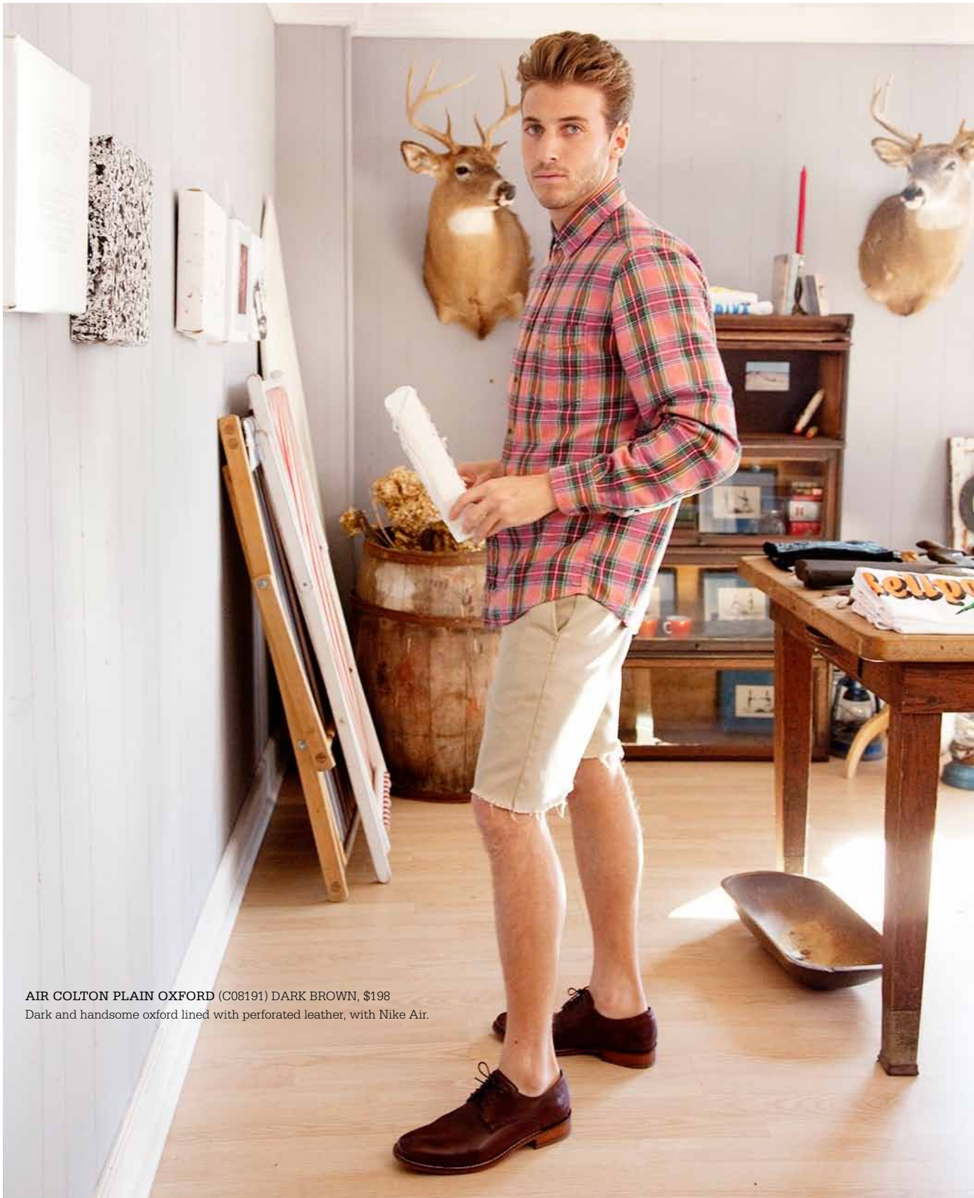
AIR COLTON PLAIN OXFORD (C08191) DARK BROWN, $198 Dark and handsome oxford lined with perforated leather, with Nike Air.